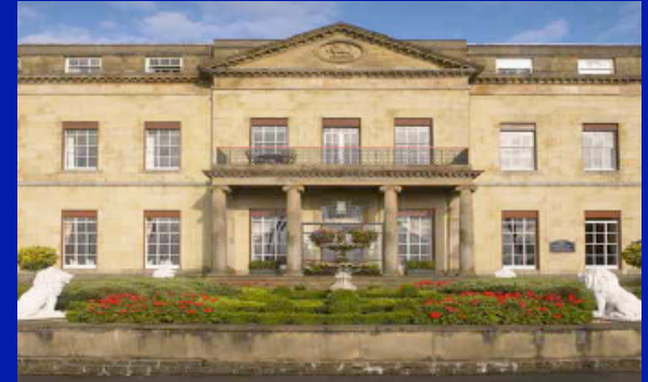
Shrigley Hall Hotel